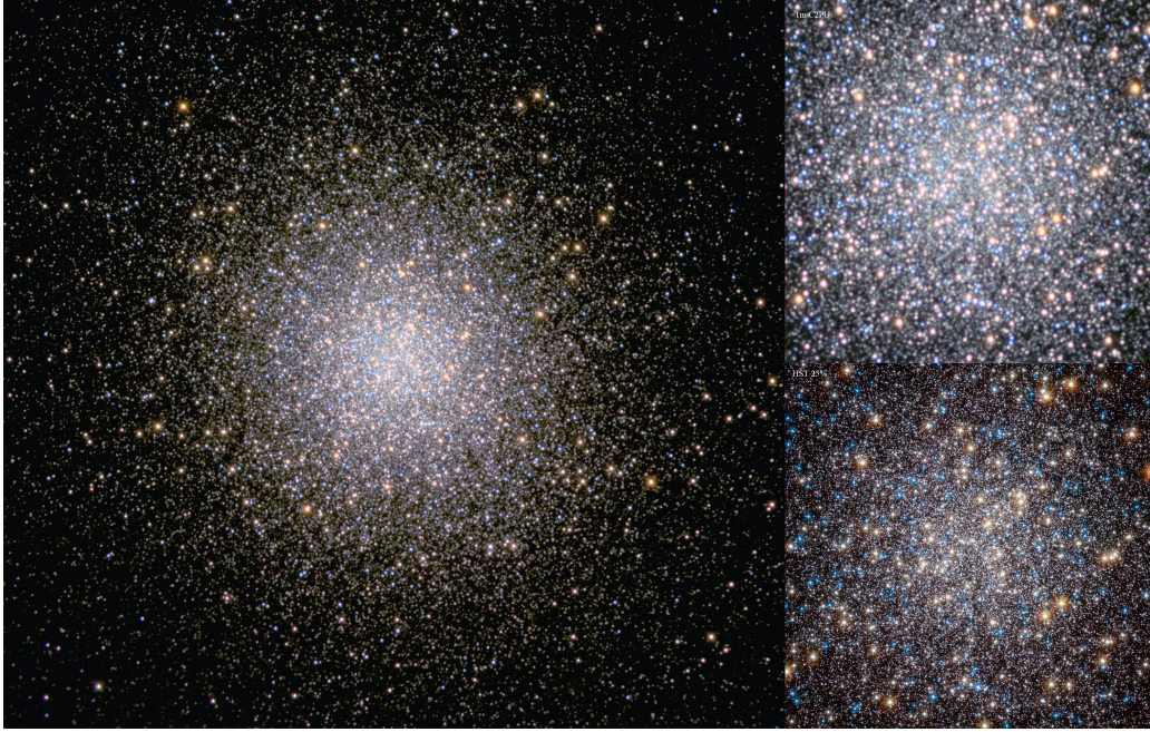
Figure 1. The globular cluster M13 from the C2PU W-Tel. Upper-right frame : a magnified crop of the center of the cluster. Lower-right frame : the same zone extracted from a HST image.

To assess the photometric quality of this new observation facility, We have followed the transit of exoplanet HAT-P-5b across its Mv = 12 host star, on August 17 th , 2012, with the same optical configuration (C2PU E-Tel ; primary F/2.88 focus ; commercial 3-lens Wynne coma corrector, B&W camera SBIG ST10XME). Each individual frame was obtained with 9 seconds exposure time, on defocused images (FWHM between 2'' and 3''). The achieved photometric accuracy is 3 millimagnitude on un-binned data, which appears to be highly promising for the future photometric and polarimetric research projects.