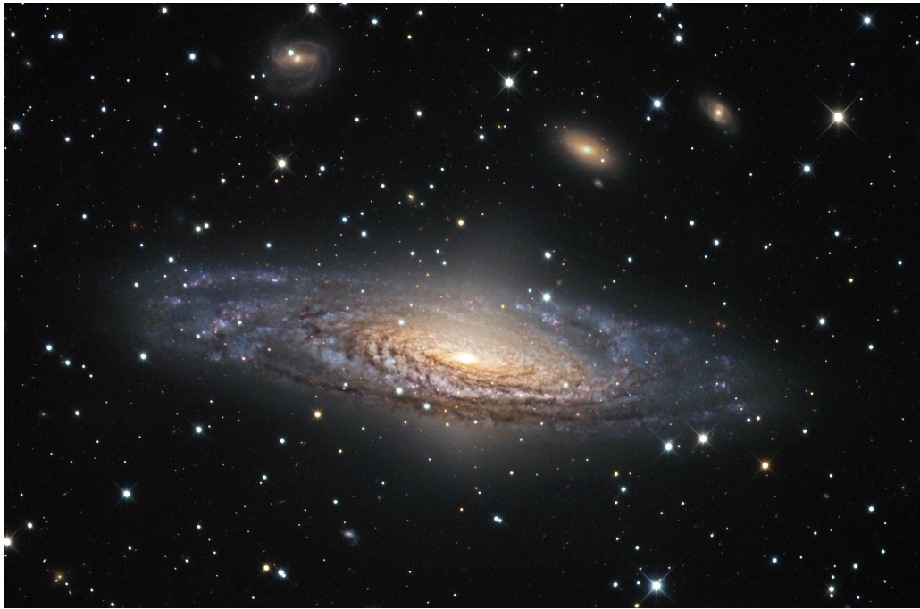
Figure 2. The NGC7331 galaxy from the C2PU W-tel.