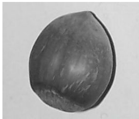
FIGURE 2. A pointed 2-sphere: the boundary of a generic hyperbolic semidirect product \mathbf{R}^2 \rtimes \mathbf{R} .

on \partial H . By assumption, this action fixes a point. So \text{Isom}(X) is focal of totally disconnected type, contradicting Corollary 19.18. \square